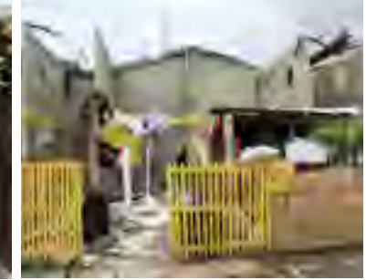
One of the houses in Legacy of Life Vill, days after the onslaught of Typhoon Glenda