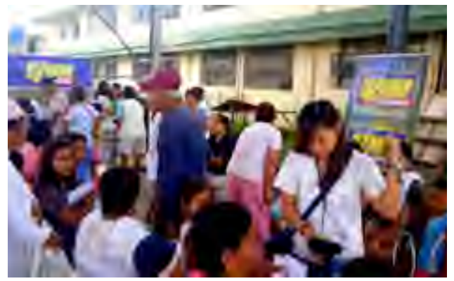
Through their help, we were able to rebuild not only houses and community facilities but also families that were affected by the typhoon.

Stories about residents helping their neighbors were shared, reflecting a hopeful sense of community amidst strong winds and rain. Our organization is grateful to our community members, project partners, donors, volunteers and staff for helping Southville 7 build back better.